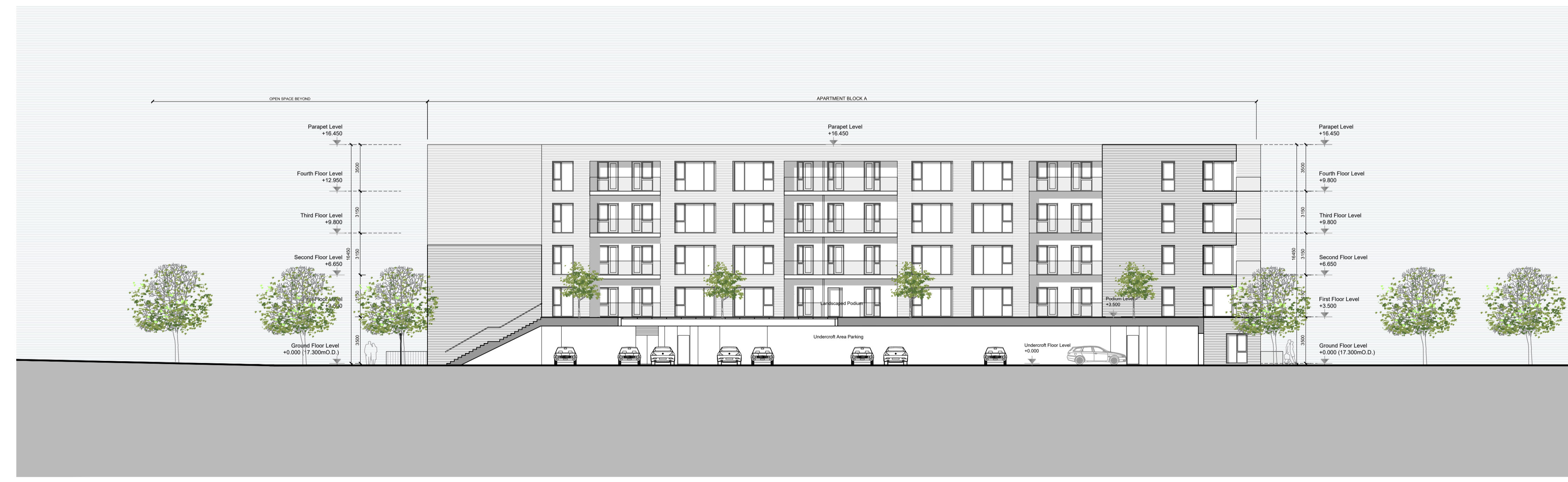
East Facing Elevation EE CHARACTER AREA 2

NOTES: DO NOT SCALE FROM DRAWINGS. WORK TO FIGURED DIMENSIONS ONLY. ARCHITECT TO BE NOTIFIED OF ALL DISCREPANCIES.