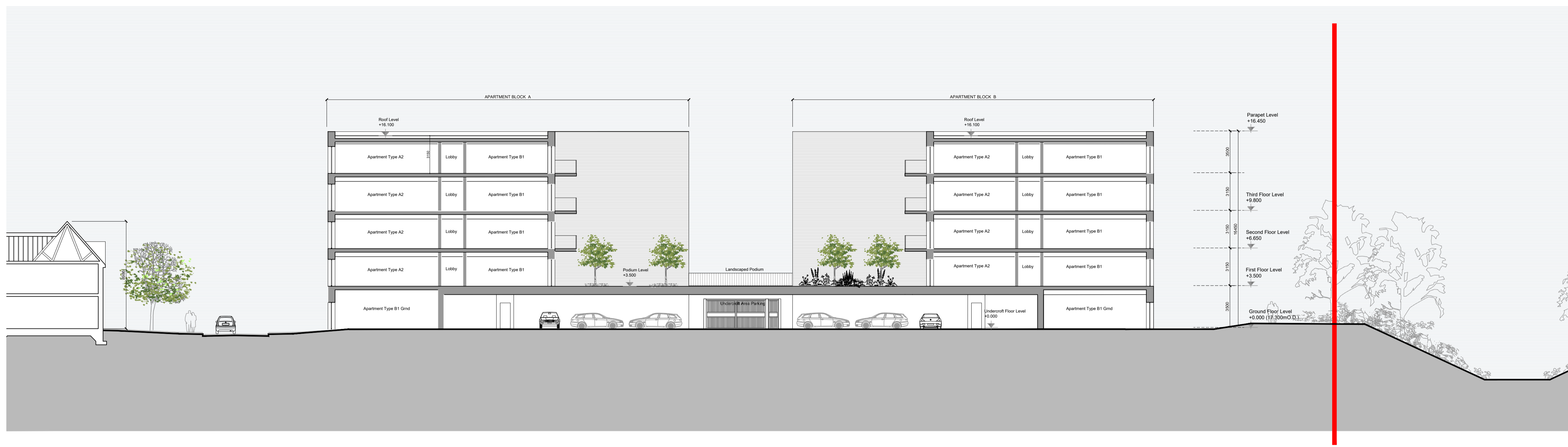
South Facing Elevation FF CHARACTER AREA 2 (Chailey Stock Brick)